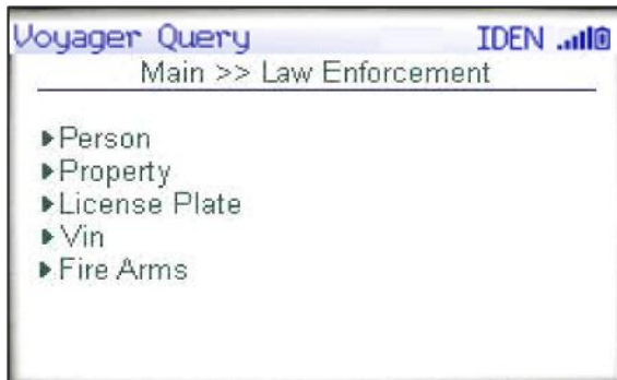
1. Select an Inquiry Type

Voyager Query is designed for ease of use and quick data access to ensure officer safety.