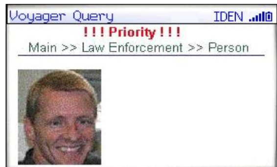
4. See mug shots and images