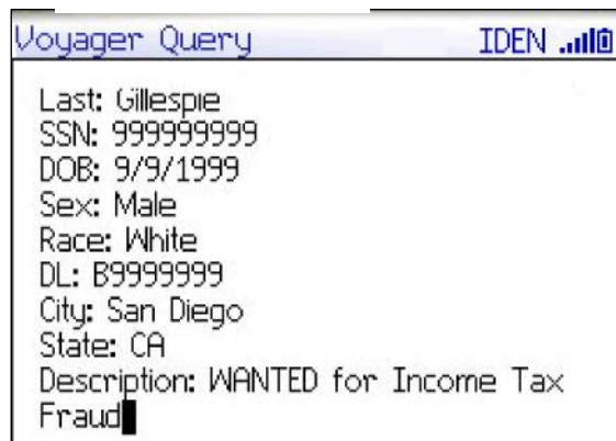
3. View data return from multiple sources